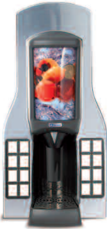
FT-16 (shown with standard stainless-look graphics)